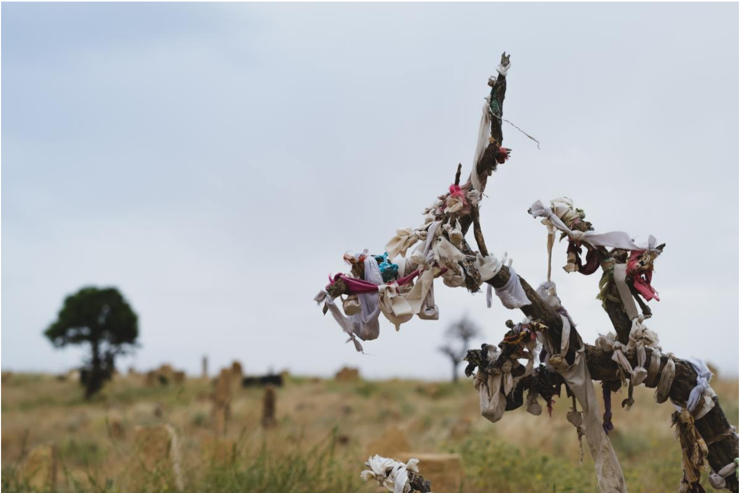
Views around the Ezidi shrine of Shebl Qasim atop Shingal mountain.

Event info: https://www.niod.nl/en/activities/witnesses-violence